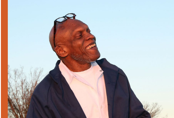
THE ATLANTA JOURNAL-CONSTITUTION